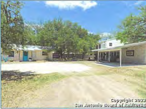
Copyright 2022 San Antonio Board of Realtors®

Addr: 953 E Ranch Rd 337 MLS #: 1609864 Status: Sold Class: RE Area: 3100 Grid: List Price: $829,995 Int.St./Dir: Google Maps Subdivision: FRIO RIVER RANCHES (Common) / RIVERSIDE RANCH (Legal) City: Leakey Zip: 78873 Type: SFD County: Real CAN#: A24-17-24 AdSf: 2321 Legal: LOT 24 FRIO RIVER RANCHES IMPROVEMENTS HWY & RIVER FRONTAGE Block: UNK Lot: 24 Currently Leased: Lot Size: 1.68 Lot Dimensions: Lease Expiration: Sch: Leakey BR: 4 Year Built: 1970 Elem: Leakey FBaths: 3 HBaths: 1 Middle: Leakey Builder: UNK Recent Rehab: Yes High: Leakey Constr: Pre-Owned New Constr. Est. Completion: